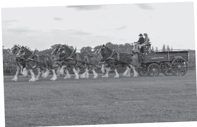
Reining in the fun

The Fergus Agricultural Society thanks all exhibitors and volunteers for helping to make our Show a success.