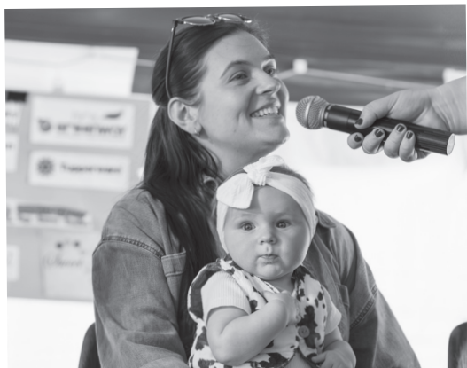
Baby Show cutie!