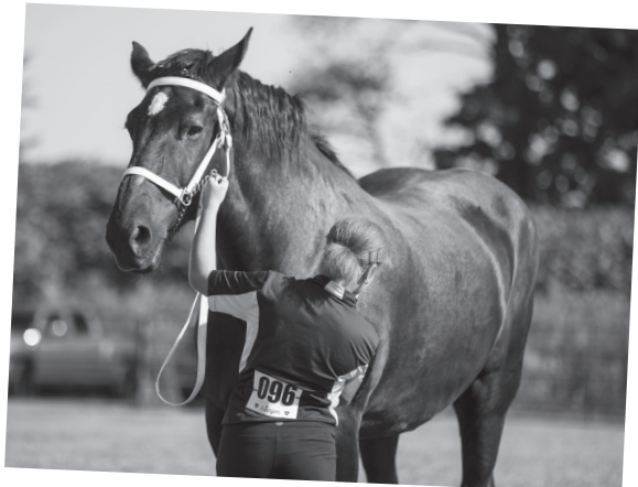
Neigh-ver a dull moment at the fair!