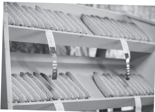
Award winning corn