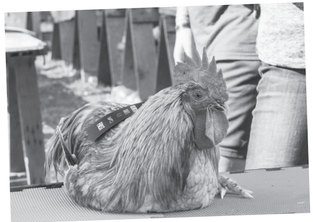
That's an egg-cellent winner!

Prizes: 1st - $10.00, 2nd - $9.00, 3rd - $8.00, 4th - $7.00, 5th - $6.00, 6th - $5.00