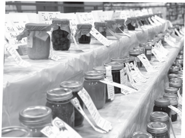
Delicious Jams & Jellies

Fresh Box Market Special: Most points in Class 46, section 30 to 34 Prize: Gift Card