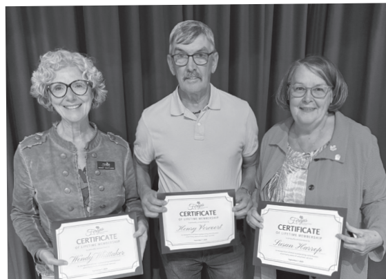
2025 Life Members